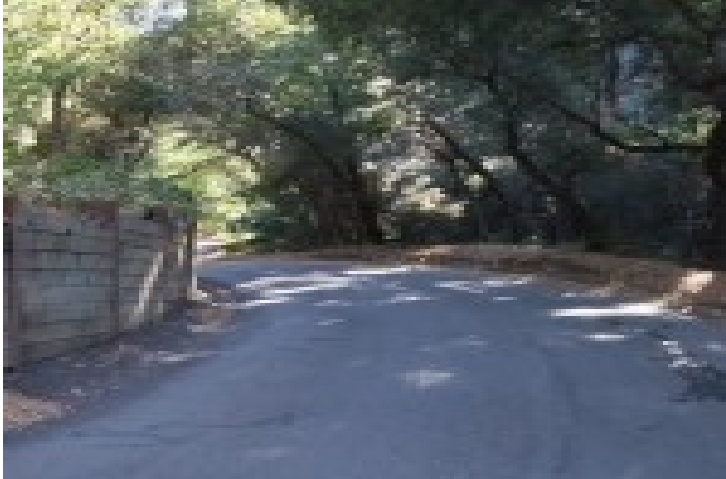
"Pipe Country", about 1/3rd of the way up

So a couple hours after getting home from my first ride today, it was obvious my son wasn't going anywhere, and if I didn't get out soon, I wouldn't be either! So I set out for a quick run up Old LaHonda, determined to "document" it as a featured ride on our website. Unfortunately, because it was getting late, the sun wasn't in a good mood for photos. But I did get a few, which I'm posted.