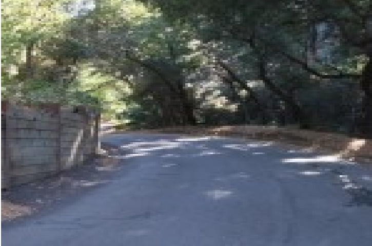
"Pipe Country", about 1/3rd of the way up

So a couple hours after getting home from my first ride today, it was obvious my son wasn't going anywhere, and if I didn't get out soon, I wouldn't be either! So I set out for a quick run up Old LaHonda, determined to "document" it as a featured ride on our website. Unfortunately, because it was getting late, the sun wasn't in a good mood for photos. But I did get a few, which I'm posted.