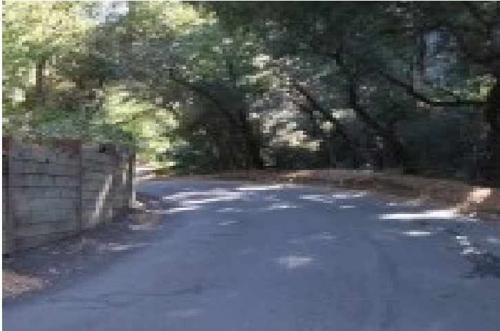
"Pipe Country", about 1/3rd of the way up

So a couple hours after getting home from my first ride today, it was obvious my son wasn't going anywhere, and if I didn't get out soon, I wouldn't be either! So I set out for a quick run up Old LaHonda, determined to "document" it as a featured ride on our website. Unfortunately, because it was getting late, the sun wasn't in a good mood for photos. But I did get a few, which I'm posted.