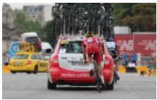
A pair of riders drafting behind cars to get back to the field after a crash