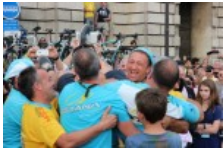
Vino, Tinkoff (the guy being hoisted) and other Astana folk celebrating Nibali's win