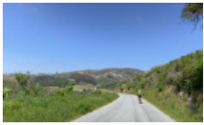
Stage Road between Pescadero and San Gregorio