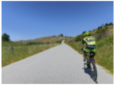
Cloverdale Road heading north