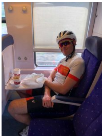
Heading to Chambéry on the train

I try to make our first ride in France reasonably creative will also making sure it's not going to kill us. Since it comes the day after arrival, especially after arriving after 8pm local time (and for me, about 32 hours total without more than a brief catnap... if that). In the Alps, making it interesting is a bit challenging if you do a traditional loop of some sort, because the distance can get to be a bit too much. That's where the local trains come in. You get create a very interesting, greatest-hits version of a ride, by taking the train out and riding back.