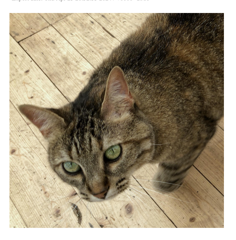
The camp cat