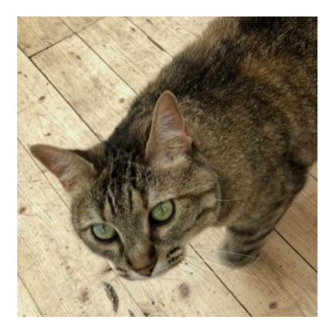
The camp cat

There are two ways to climb Luz Ardiden; the normal way, and the way few seem to mention but looks nice on the map. I did quite a bit of research and really couldn't find much information on the alternate routing, that connects up to the main road about 4 very long kilometers to the stop (the last 4 kilometers are ALWAYS longer than the rest, by the way). But there were mentions of it being much quieter, much cooler because most of it is tree-shaded, and also, paradoxically, both steeper and longer. If it's longer, how can it be steeper?