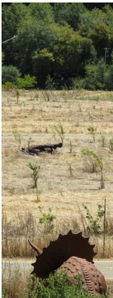
The fallen Mastadon near Pescadero

Do I ever get tired of repeating the same Sunday ride so frequently? Up Old LaHonda, over Haskins, lunch at Arcangeli Pescadero market, north into the headwind on Stage and up Tunitas? I have no doubt that Arcangeli market has much to do with the route choice! The chicken club sandwich and oversized cookies are pretty darned awesome.